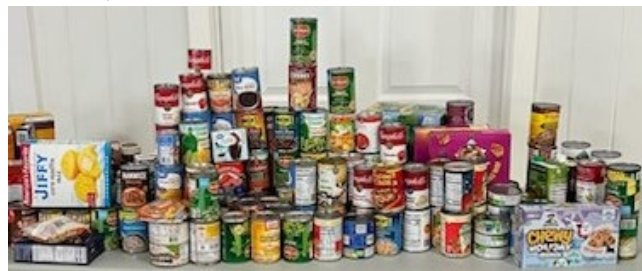
Some of the food items collected by HTES students.

Student Life: The students elected their peers to the Student Council which immediately went to work by encouraging their fellow students to participate in a food drive to benefit the hungry during this holiday season. Over 400 food and other non-perishable items were collected and delivered to the Salvation Army food pantry. Members of the Student Council were officially commissioned at a Thanksgiving Eucharist held on Thursday November 21.