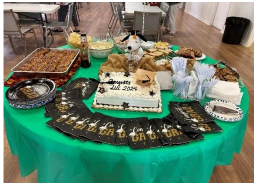
Figure 4-Celebration for Lili